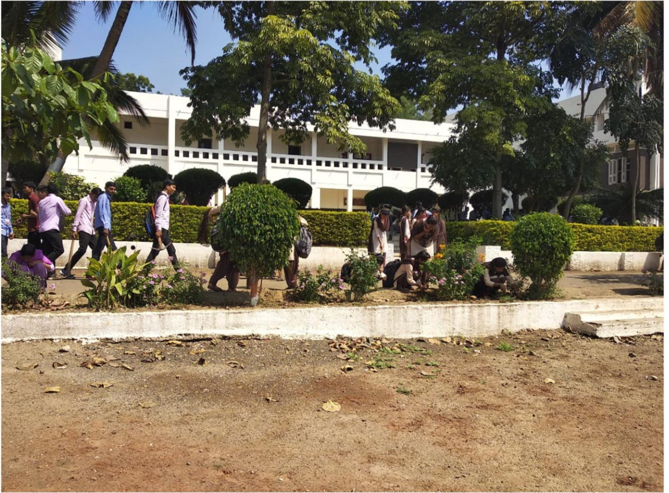
Mahatma Gandhi Jayanti: Cleaning Drive, Date: 02/10/2018