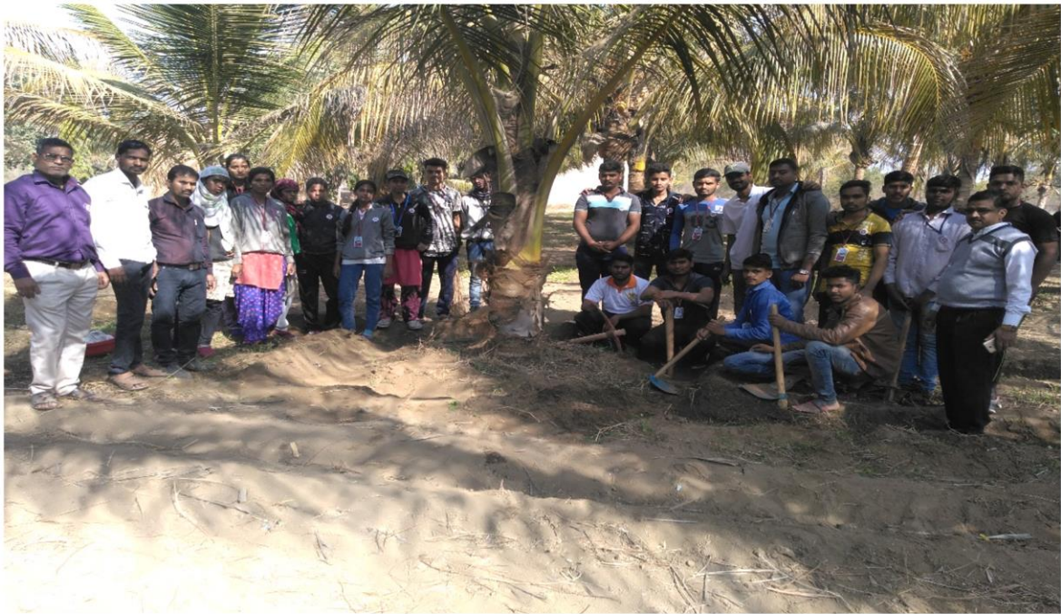
Coconut tree farming at Bharadi Village and their maintenance was done by 150 NSS volunteers.