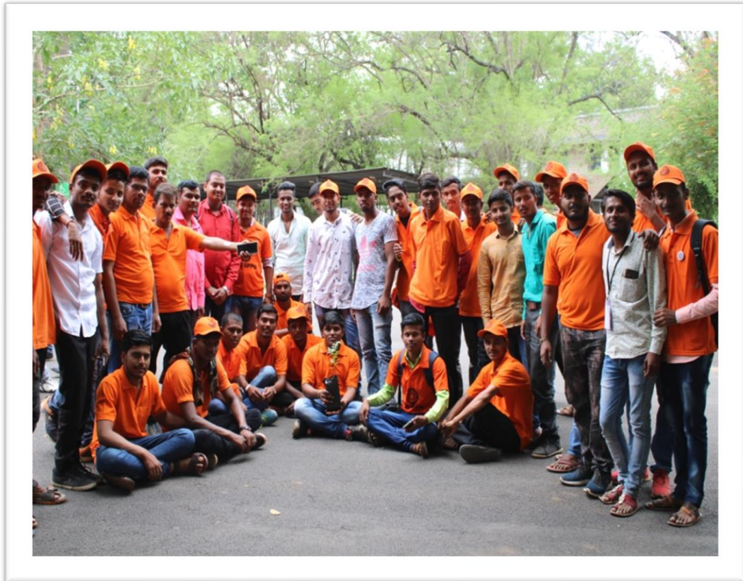
Participation in Distribution of Tree Sampling- Guinness World Record 23/06/2019