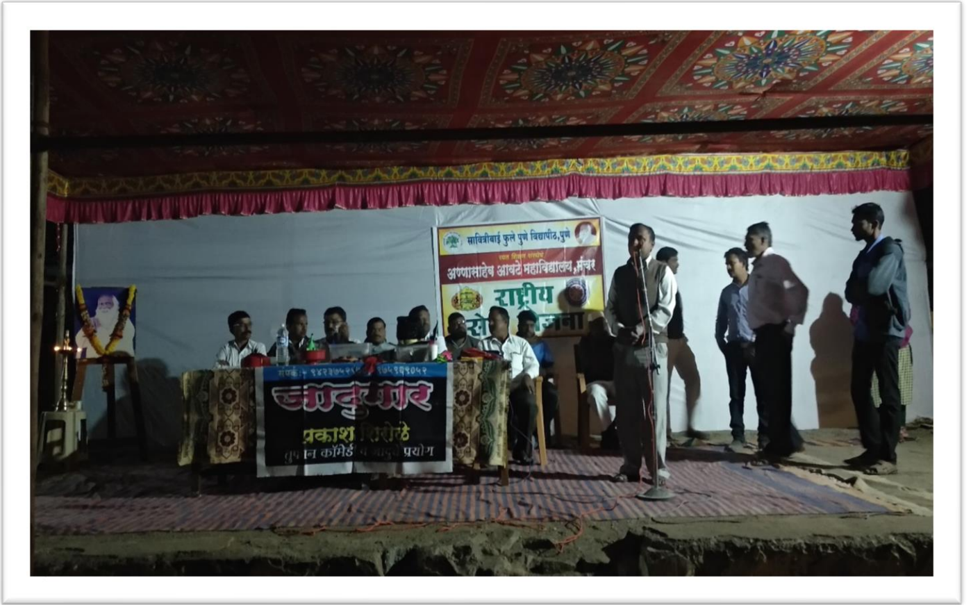
Magic Program For Awareness Of Black Magic

The department of NSS of Annasaheb Awate College, Manchar organized a special camp in the village of Bharadi. In this program, the Bharud program was organized for the purpose of providing guidance to the students for black magic awareness.