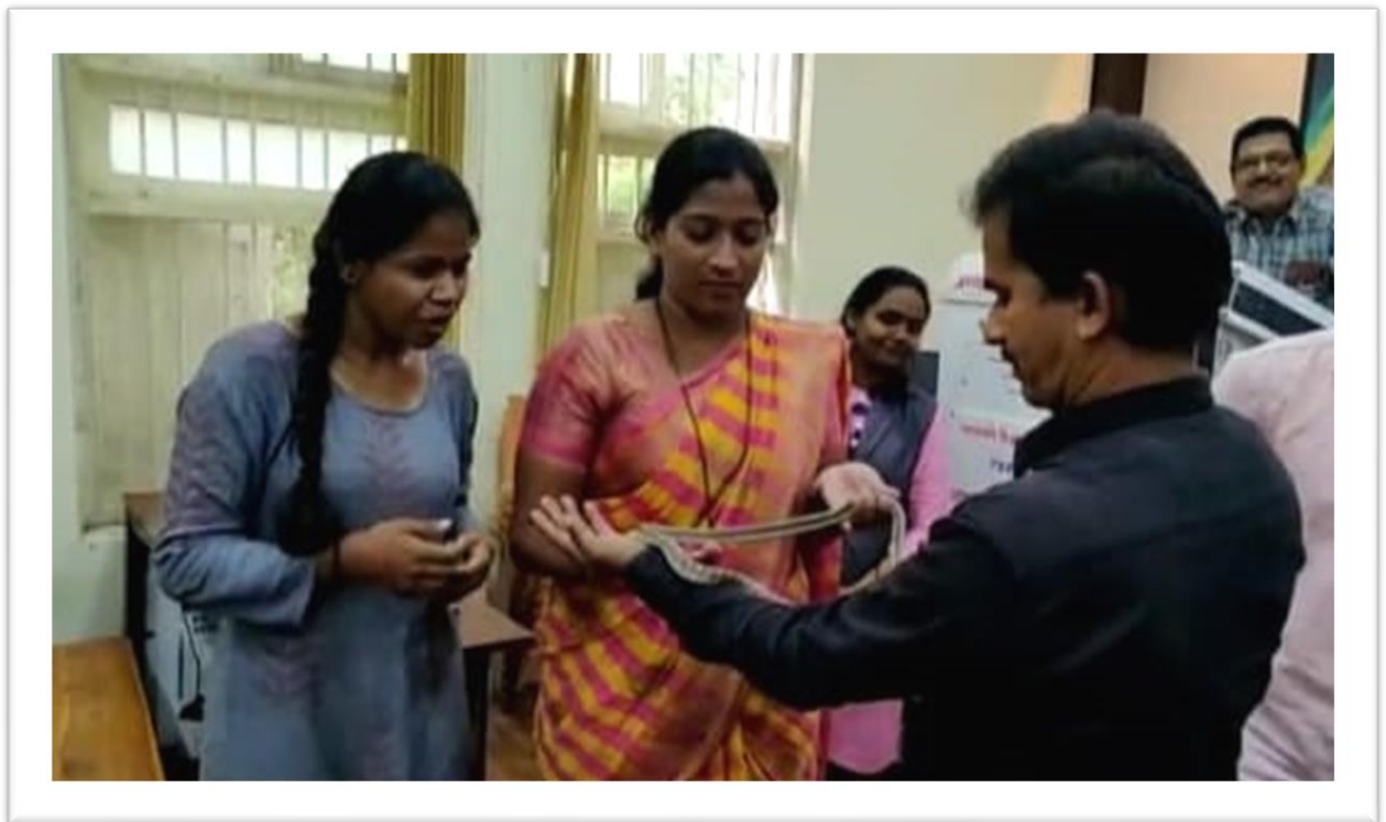
Special Lecture- Snake, Society and Misconceptions