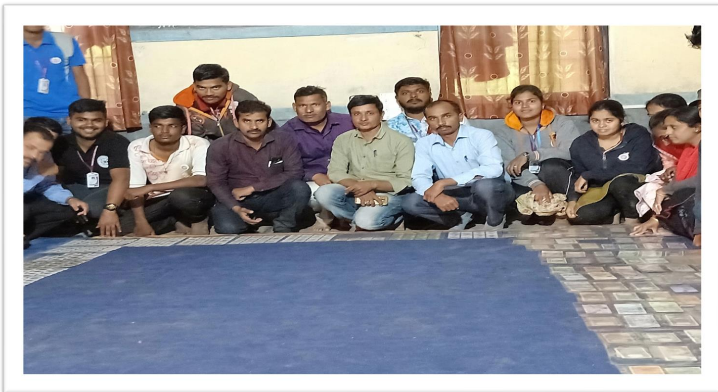
Old, New Coin Exhibition, Date: 06/01/2019