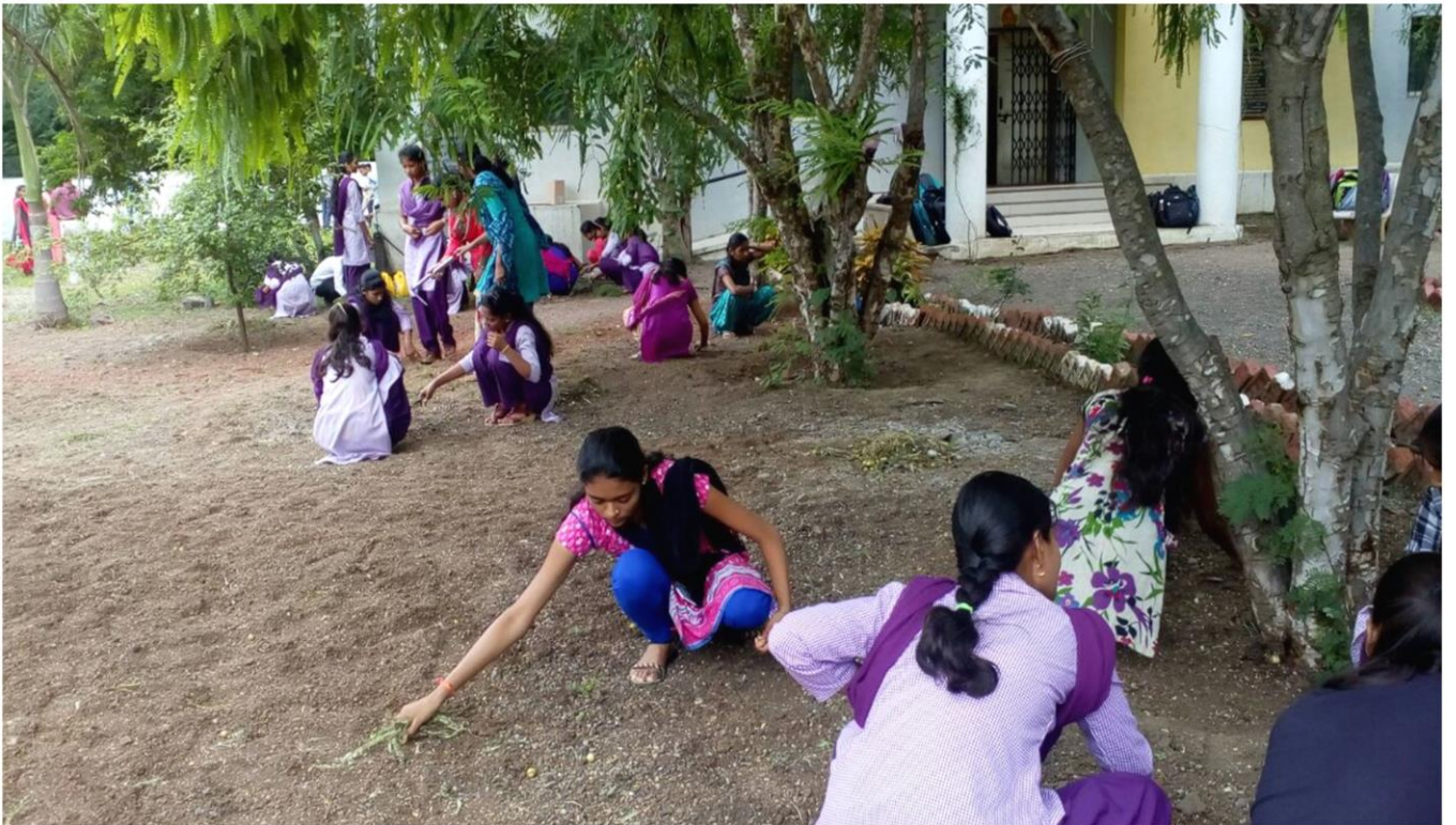
Clean Campus Drive, Date: 29/07/2018