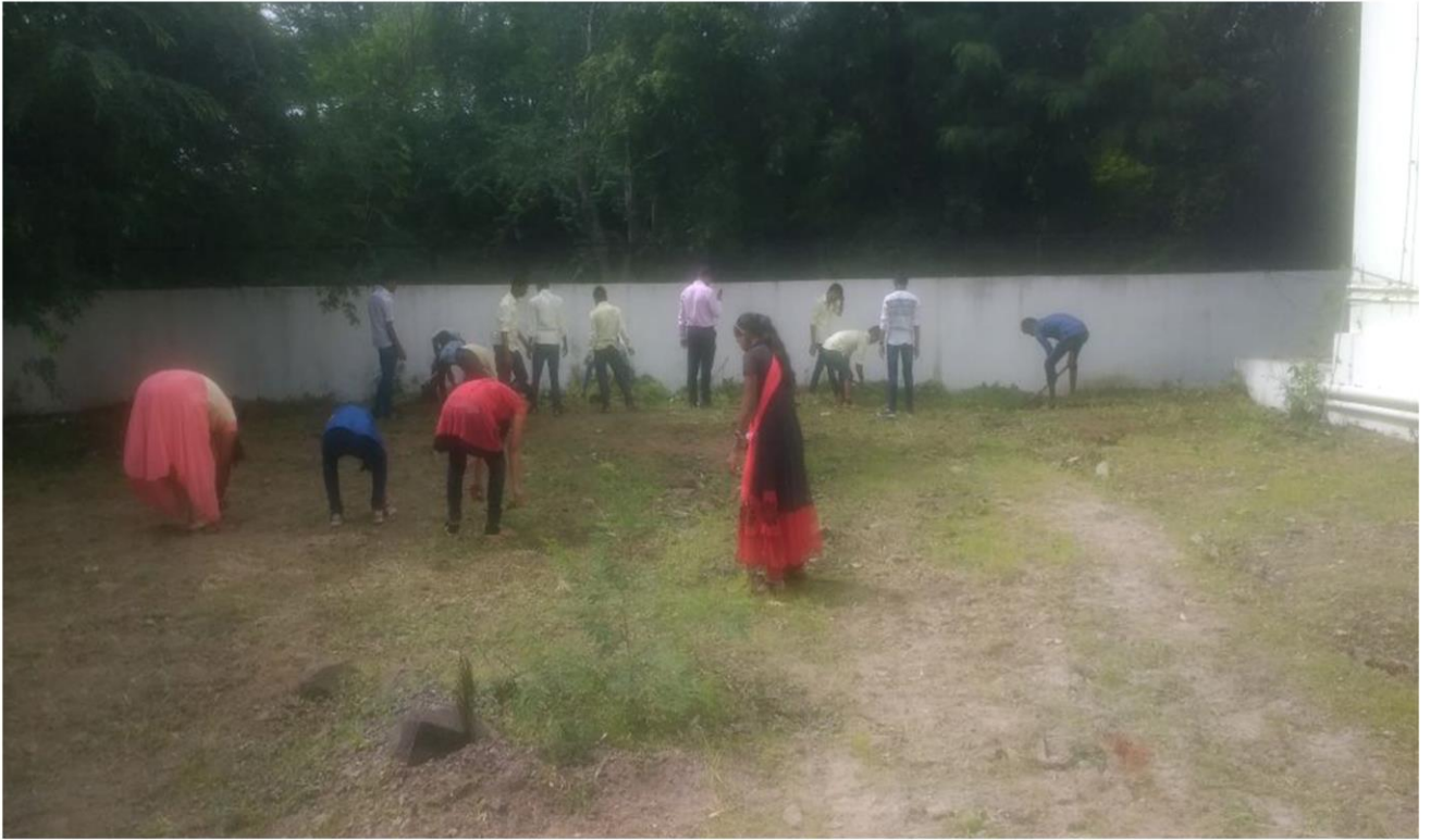
Clean Campus Drive, Date: 29/07/2018