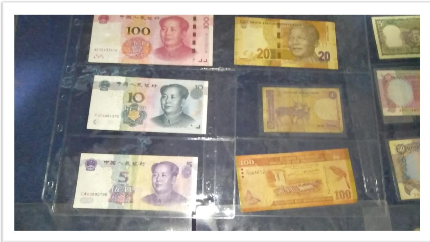
Old, New Coin Exhibition, Date: 06/01/2019