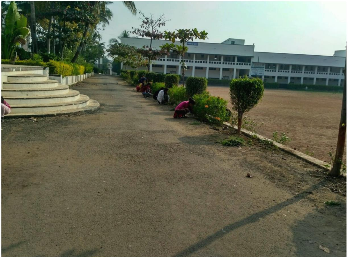
College Campus Cleanliness Campaign, Date: 15/08/2018