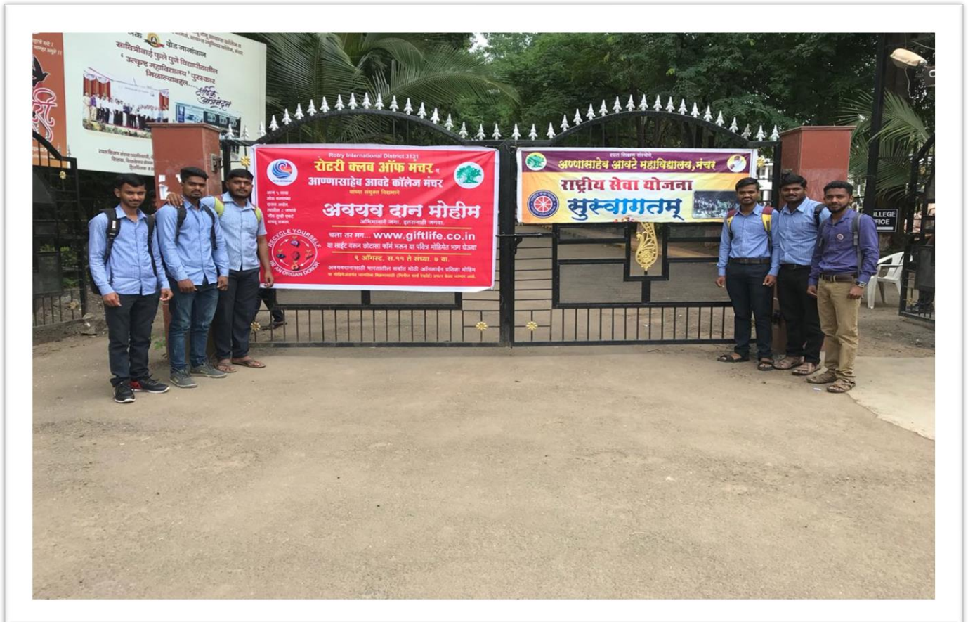
Organ Donation Campaign, Date: 09/08/2018