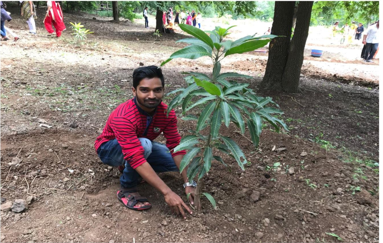
Tree Plantation Drive, Date: 29/07/2018