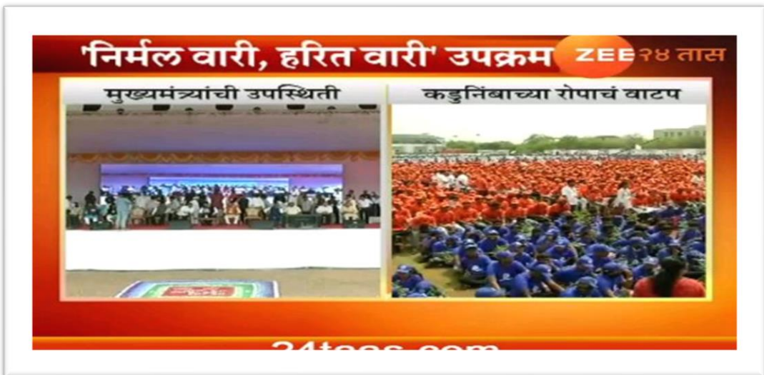
Participation in Distribution of Tree Sampling- Guinness World Record 23/06/2019