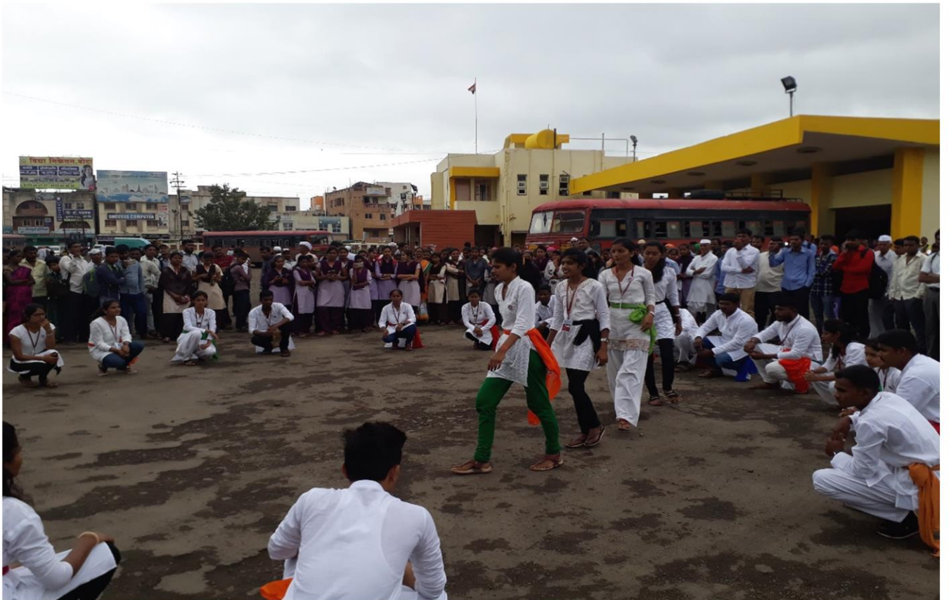
Street Play Jagar Vasundharecha, Date: 15/08/2018