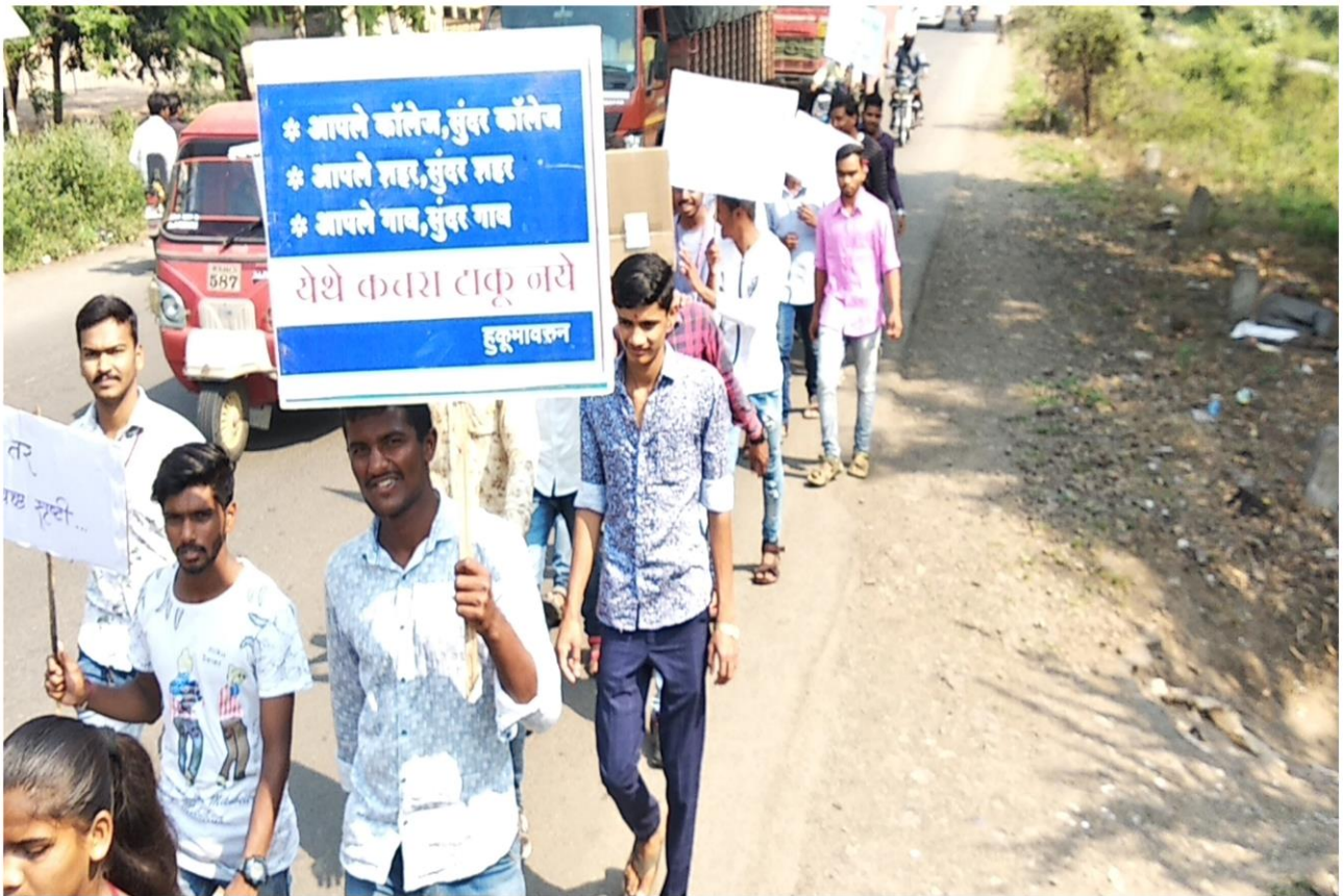
Mahatma Gandhi Jayanti and Awareness Rally