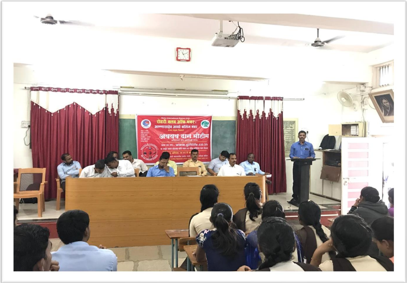
Organ Donation Campaign, Date: 09/08/2018