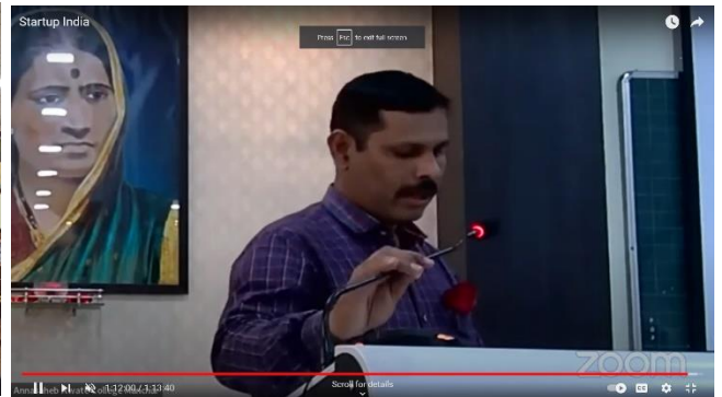
Photograph of IPR lecture: 28/02/2022, 11.00 Am- 2.00 Pm